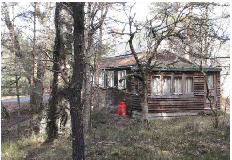
Fig. 4. Existing structure to be replaced

4. Apart from the outline permission in 2002, there are other historical permissions which are of relevance. In November 1985, the church was granted permission for conversion to a house. Prior to that, it was used by the Alvie Free Church Congregation. It appears that the bunkhouse/chalet building was used as the church hall at that time but in January 1986, the then owners of the converted church, gained permission for re-siting it to its current position and changing its use to holiday accommodation. However, no conditions were imposed