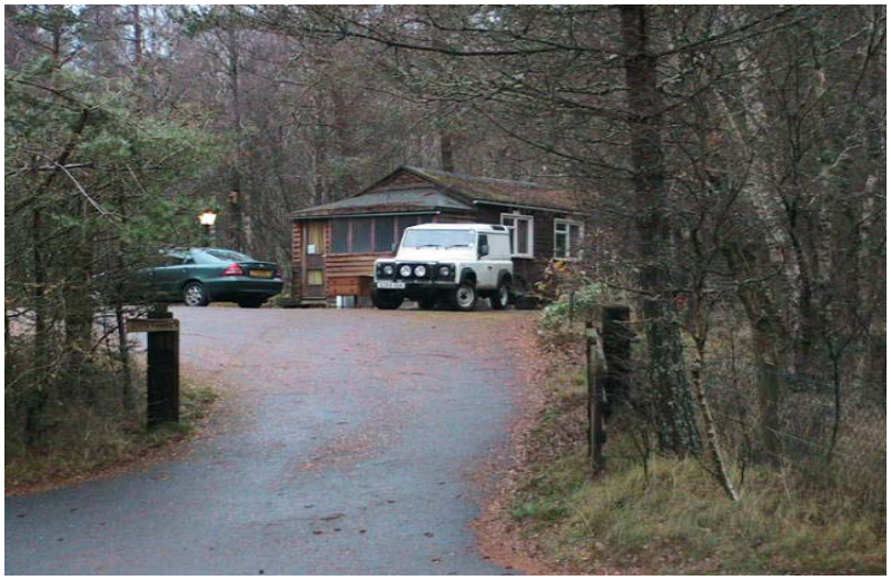
Fig. 3. Existing Structure to be replaced