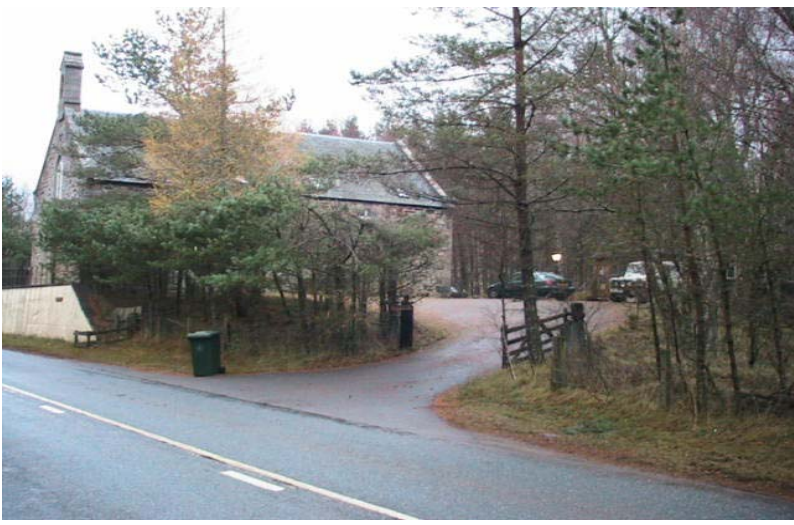
Fig. 2. Kirkbeag from B9152

1. The site to which this application relates is situated adjacent to the B9152 approximately 1km north east of Kincraig (Fig. 1). On site at present is the former Alvie Free Church which has been converted to a house. This is the applicant's house. In the grounds of the former church is a self-contained timber clad, pitched roof bunkhouse/chalet which sleeps six. This building is used for holiday accommodation but currently demands very low rental rates and is not in great demand. The site sits above the level of the public road and is surrounded in mature woodland. Access is taken directly from the B9152. There is also an established footpath from the rear of the site, adjacent to the bunkhouse/chalet which leads directly through the woodland to the minor road to Speybank lying to the south east. There is currently hardstanding parking and turning areas within the curtilage. (see Figs. 2, 3, & 4 below)